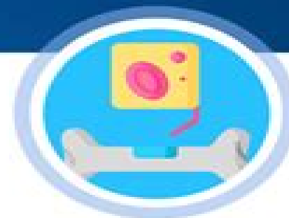
Stem cell transplantation