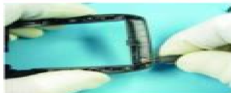
28. Release the CONN CDR.