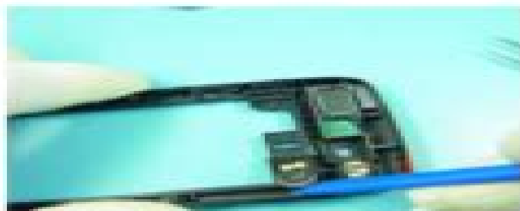
25. Remove the VIBRA.