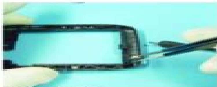
29. Remove the CONN CDR.