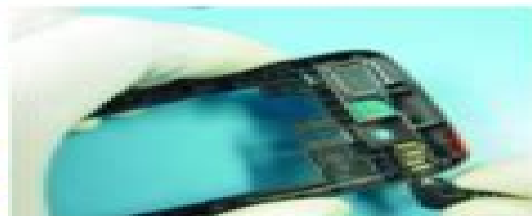
26. Release the CONN ANT.