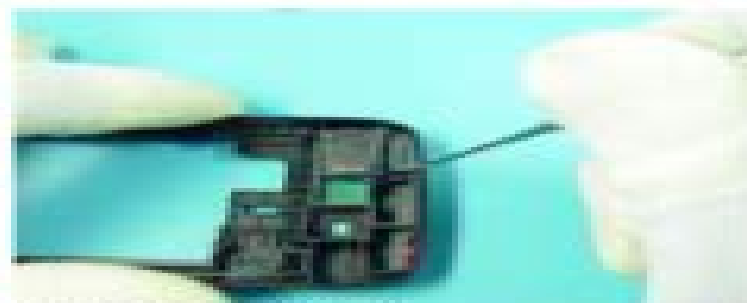
30. Remove the DRF SPLACER.