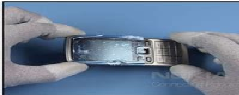
2. Always cover the windows with a protective film.