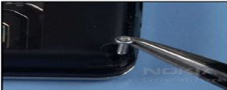
5. Remove the screws.