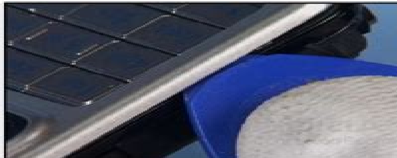
6. Unlock the plastic clips of the A-COVER with the SRT-6...