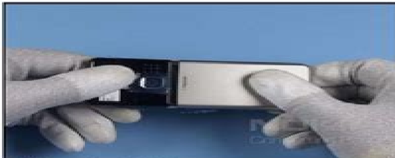
3. Shift out the C-COVER.