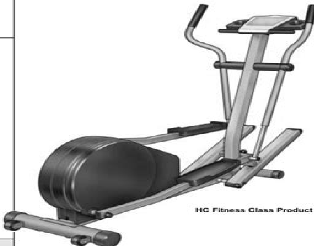
HC Fitness Class Product