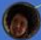
James Norton My mother's name is...