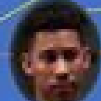
Wally West My mother's name is...