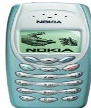
Nokia 3410 NHM-2