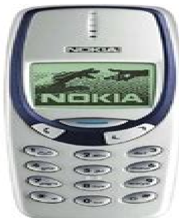
Nokia 3330 NHM-6