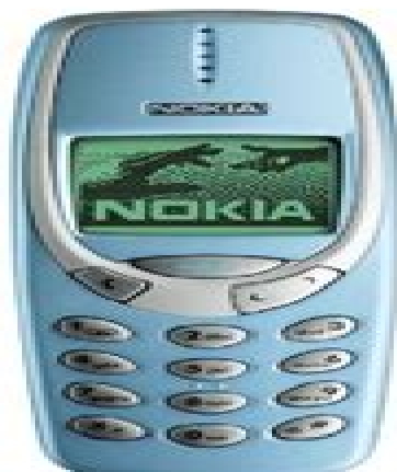
Nokia 3310 NHM-5