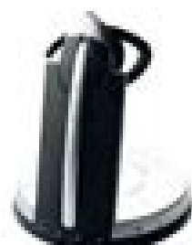
Jabra GN 9300 Duo