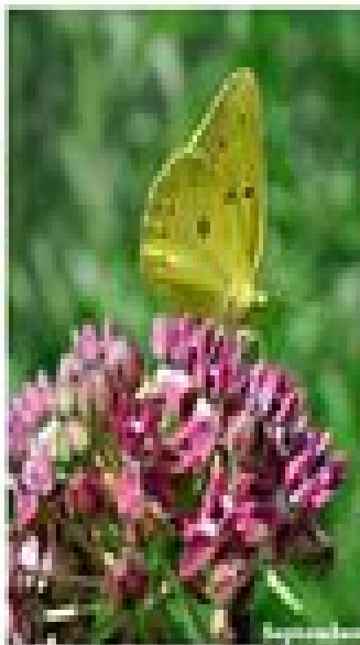
Swaroop Milkweed Asclepias incarnata ☼☼ June-August (18 in.)