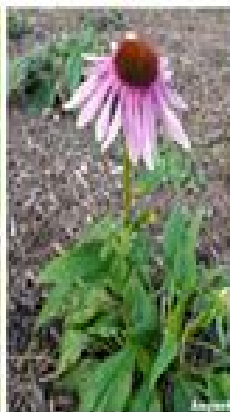
Purple Coneflower Echinacea purpurea