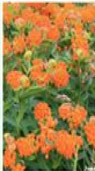
Butterfly Weed Asclepias tuberosa ☼☼ June-August (12 in.)