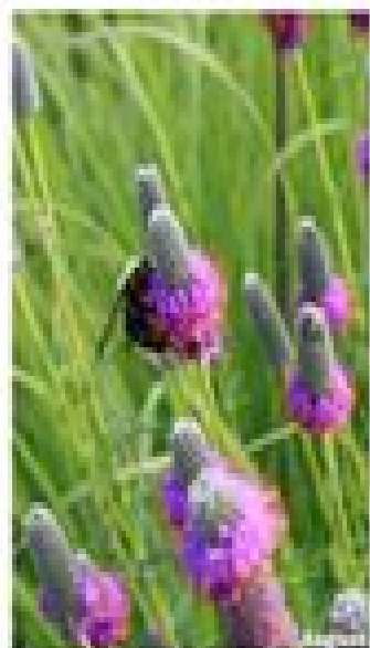
Purple Prairie Clover Dalea purpurea