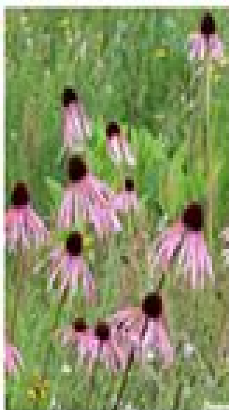
Pale Coneflower Echinacea pallida