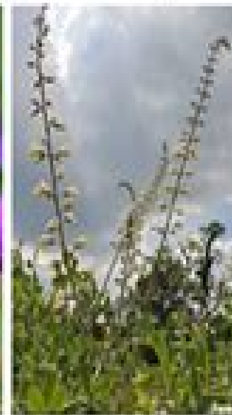
White Wild Indigo Baptisia alba ☼☼ June-July (18 in.)