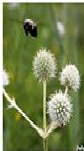
Rattlesnake Master Eryngium yuccifolium