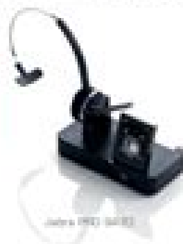
Jabra PRO 9400