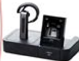
Jabra GO 6470