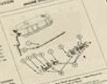
Fig. 5 - Diagram of the rocker arm shaft assembly

Check all parts for proper fit and operation. The engine should be run for a short time before use to ensure proper operation.