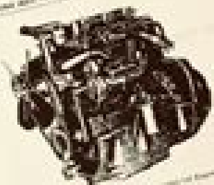
Fig. 1 - Front view of the engine