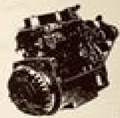
Fig. 2 - Side view of the engine