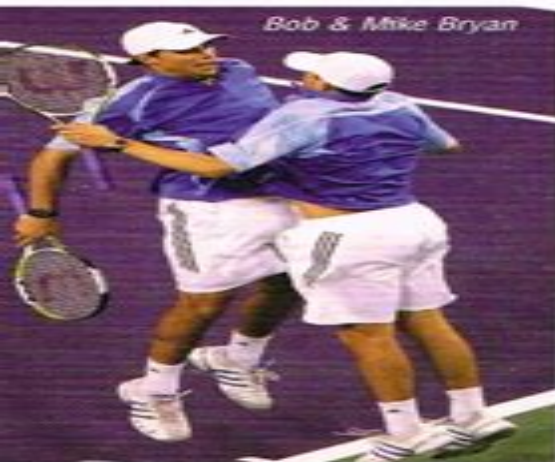
Bob & Mike Bryan