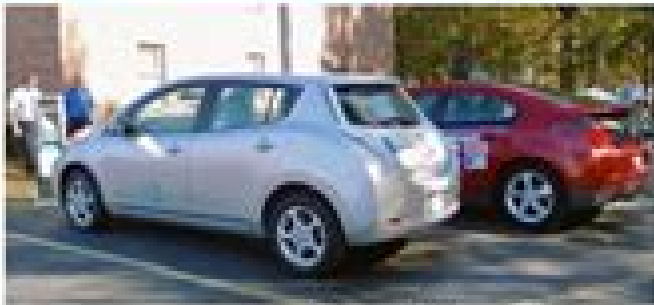
Jan - July 2013