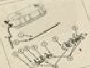
Fig. 1-5. Detail view of the engine.

Check all parts for wear and damage. Replace any worn or damaged parts. Lubricate all moving parts with oil.