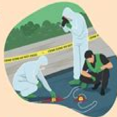
CSI (Crime Scene Investigation)