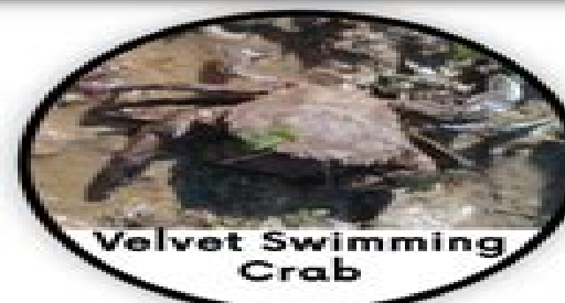
Velvet Swimming Crab