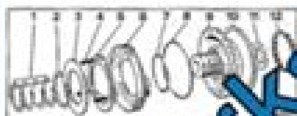
Fig. T15B-4 Center support assembly