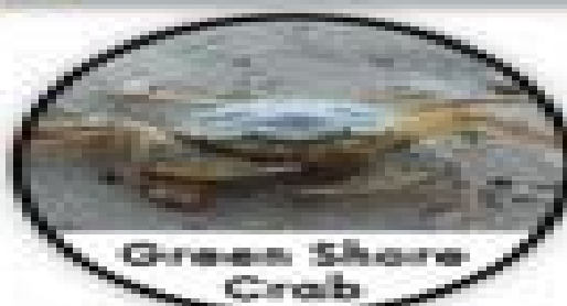
Green Shore Crab