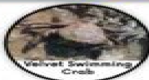
Velvet Swimming Crab