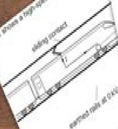
Fig. 1 shows a high-speed electric train.

The potential difference between the sliding contact on the top of the overhead cable supplies a current to the wheels. The total mass of the train is 2.5 \times 10^6 \text{ kg} .