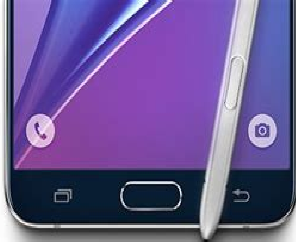
SAMSUNG Galaxy Note5