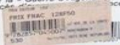
ISBN 2-607-04-500-X 98-11 917-278-0 135 F TTC