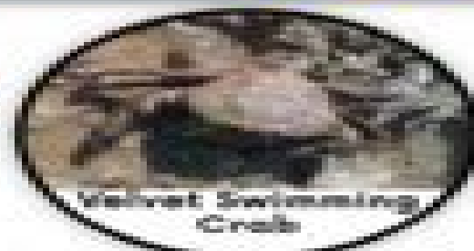
Velvet Swimming Crab