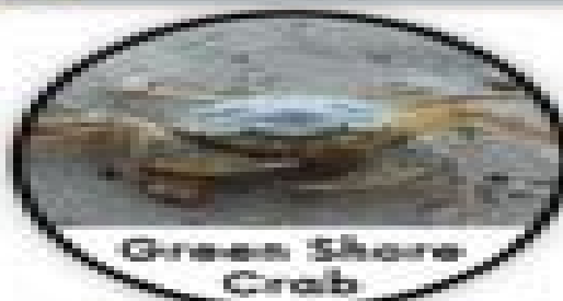
Green Shore Crab