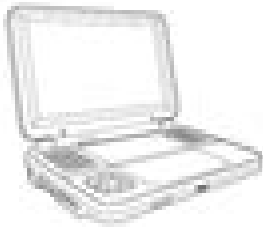
DRCA200 Rear View Rear View