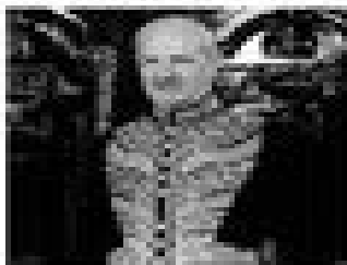
Homepage of the Great Medicine Reservoir

Here is page 1 to give you writing. Begin writing your news article on page 2.