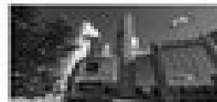
Great Medicine Reservoir, a view from the reservoir

→ To celebrate the opening of the reservoir centre and to have news about 17th Great Medicine