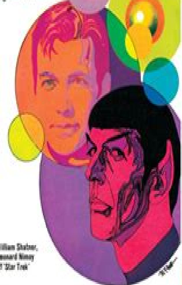
William Shatner, Leonard Nimoy of "Star Trek"