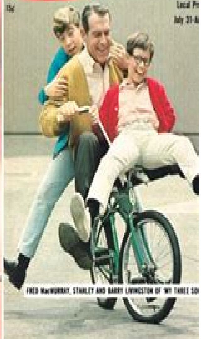
FRED MacMURRAY, STANLEY and BARRY LIVINGSTON OF "MY THREE SONS"