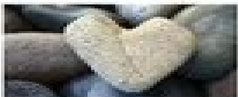
Shaped like a heart