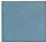
21 Light Blue Metallic