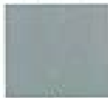
40 Light Jadestone Metallic (Blue-Green)