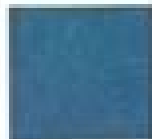
20 Bright Blue Metallic