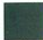
48 Dark Green Metallic