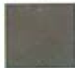
37 Medium Champagne Metallic