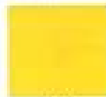
51 Bright Yellow