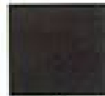
67 Dark Brown Metallic