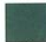
47 Jadestone Metallic (Blue-Green)