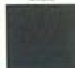
84 Dark Charcoal Metallic