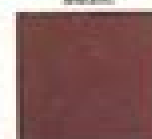
72 Medium Maroon Metallic