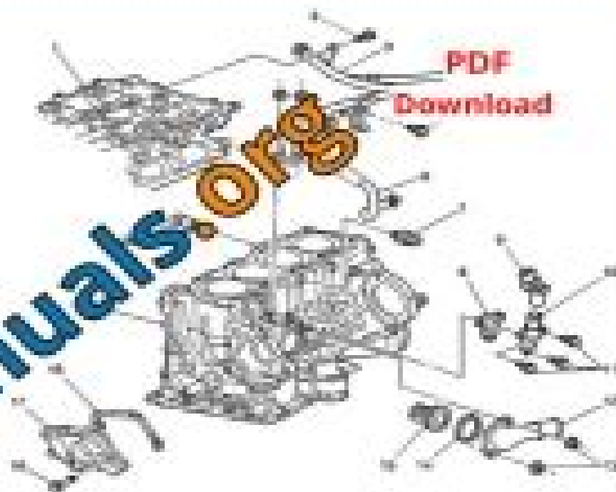
Fig. 3: Oil and Cooling System Components View