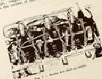
Fig. 1-2. Side view of the engine showing the timing gear and the timing belt.

The fuel system is a carburetor type. The fuel is supplied to the carburetor from a fuel tank. The fuel is then distributed to the four cylinders by the carburetor.