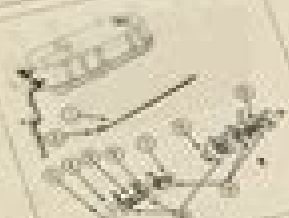
Fig. 1-5. Side view of the engine showing the timing gear and the timing belt.

10. Remove the rocker arm shaft assembly. The rocker arm shaft assembly is located at the front of the engine.