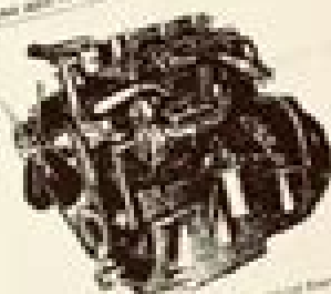
Fig. 1-1. Front view of the engine showing the cylinder head, valves, and timing gear.