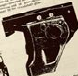
Fig. 1-4. Side view of the engine showing the timing gear and the timing belt.

The fuel system is a carburetor type. The fuel is supplied to the carburetor from a fuel tank. The fuel is then distributed to the four cylinders by the carburetor.