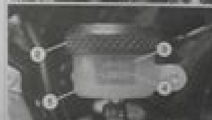
Figure 1-14. Rear Brake Master Cylinder Reservoir