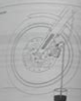
Figure 1-13. Bleeding Hydraulic System

1. If only one wheel equipped with dual front disc brake, repeat the procedure for other caliper.