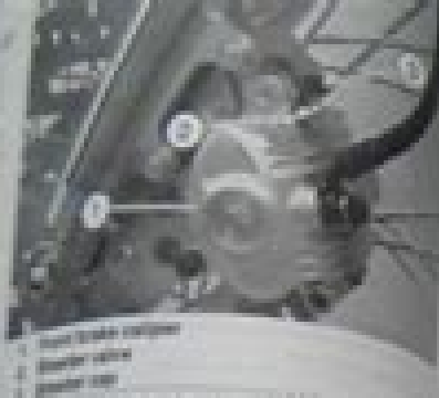
Figure 1-12. Front Brake Caliper