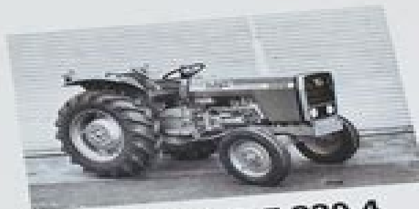
MF 220/MF 220-4 TRACTORS