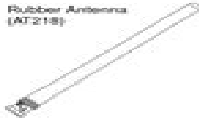
Rubber Antenna (AT218)