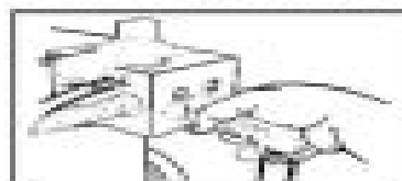
Attach Suction Set