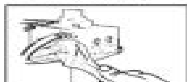
Attach Paint Hose