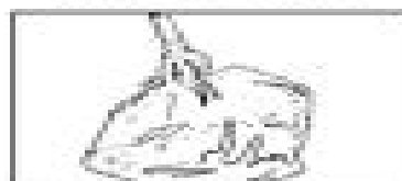
Short Term Storage