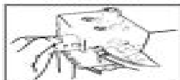
Prepare to Prime