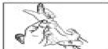
Attach Tip to Gun