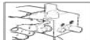
Attach Return Hose