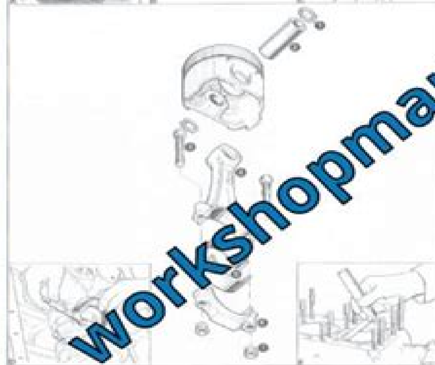
Fig. 11B-13 Inspecting the compression head and steel plates

Intermediate shaft plates and rear band - To inspect