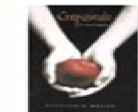
1 Crepúsculo Stephenie Meyer $199