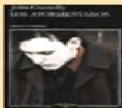
Los Atomizados John Connolly Tusquets $299

» El efímero John Connolly ha ganado seguidores y reconocimiento crítico a la largo de los últimos 10 años con sus novelas negras protagonizadas por un detective al que bautizó Charles Parker. Con lo que desea una vocación tanto para las novelas y acertas como un gusto por el jazz. En su nueva entrega, Parker persigue a un tal Méndez, quien acusa a la hija de un pequeño niño desaparecido después de serlo descubiertos los abusos contra sus padres. Un libro imprescindible.