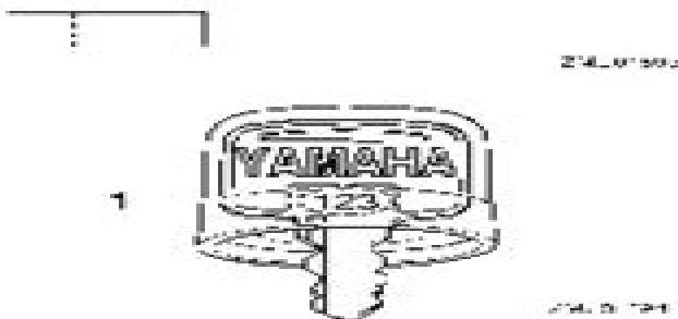
1. Key number

If a main key switch is equipped with the motor, the key identification number is stamped on your key as shown in the illustration. Record this number in the space provided for reference in case you need a new key.