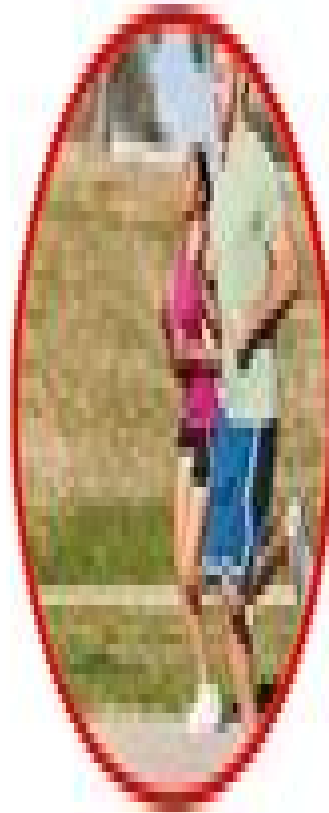
Exercise and activity