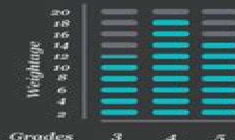
Number and Operations - Fractions (NF)