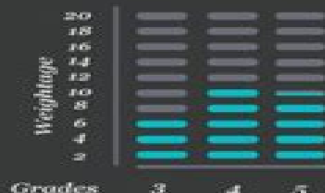
Number and Operations in Base 10 (NBT)