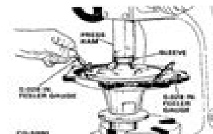
Figure 10.14. Press on Impeller and Check Impeller to Housing Clearance