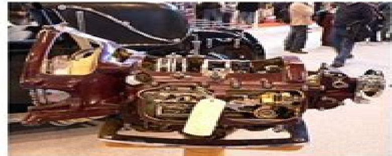
Photographs of a cut-away Rolls-Royce Hydramantic gearbox taken on a recent exhibition

The four speed automatic transmission fitted to the Silver Cloud and other Rolls-Royce and Bentley models owed its origins to General Motors in the United States. The Hydramantic transmission was the world's first mass produced fully automatic gearbox. G.M. tested their first prototypes in 1938. After further refinement the transmission was finally launched late in 1939 with some fanfare and became known as "Hydramantic drive". Initially it was fitted as an option to Oldsmobile's 1940 models costing around £12. Within a year of the launch of "Hydramantic drive" Cadillac offered it as an option on their cars. Pontiac not wanting to be out done by the competition also started fitting the Hydramantic shortly afterward. 200,000 Hydramantic transmissions were built before the 2nd world war stopped production. The tooling was put away until hostilities ceased. By 1946 Hydramantics were once again in production.