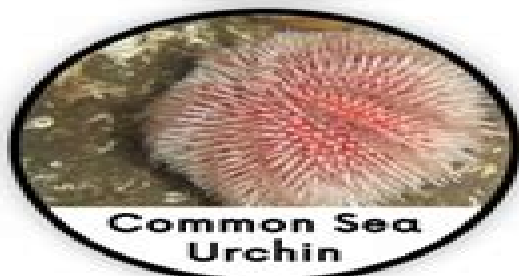
Common Sea Urchin