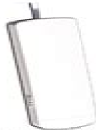
Figure 1 S541.RF/RT3

The RT3 (S541.RFT), a modified S541.RF, comes equipped with a temperature sensor and dispenses with the wiring harness for use as a low-cost remote battery operated temperature measurement device only.