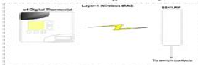
Figure 2 Network Topology