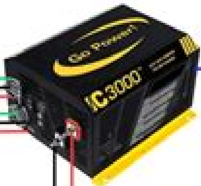
Inverter / Charger