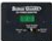
SurgeGuard Total Electrical Protection