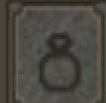
Best F2P Melee Armour