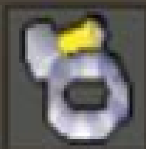
Best P2P Strength Armour