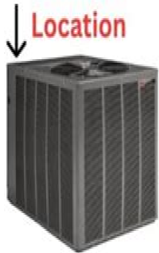
OUTDOOR UNIT (AIR CONDITIONER/HEAT PUMP)