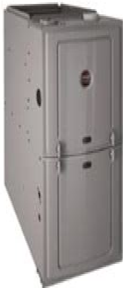
INDOOR UNIT (FURNACE/AIR HANDLER)

Model & Serial Number Location Inside Top Cover