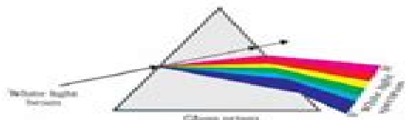
Figure 11.5 Dispersion of white light by the glass prism