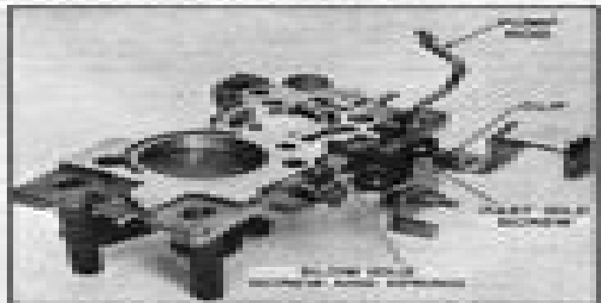
FIGURE 14 THROTTLE BODY

2. Building pressure chamber from outer ring, inner ring and all gasket and insulation from by placing gasket on wall with glue or tape. End of wall should join inward toward chamber base.