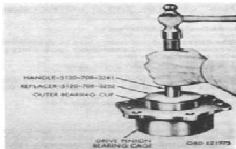
Figure 95. Installation of outer bearing cup

b. Using replacer 5120-708-3256 with handle 5120-708-3241, drive the seal even with top of bearing cover (fig. 96).