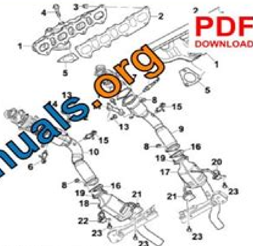
Fig. 88: Component overview - Cayenne Turbo