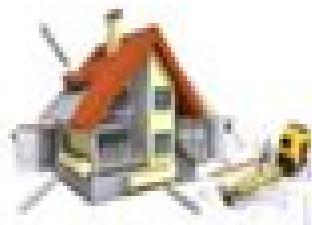
PROPERTY MANAGEMENT OFFICE