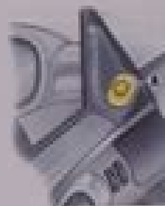
Expositionen des Motors